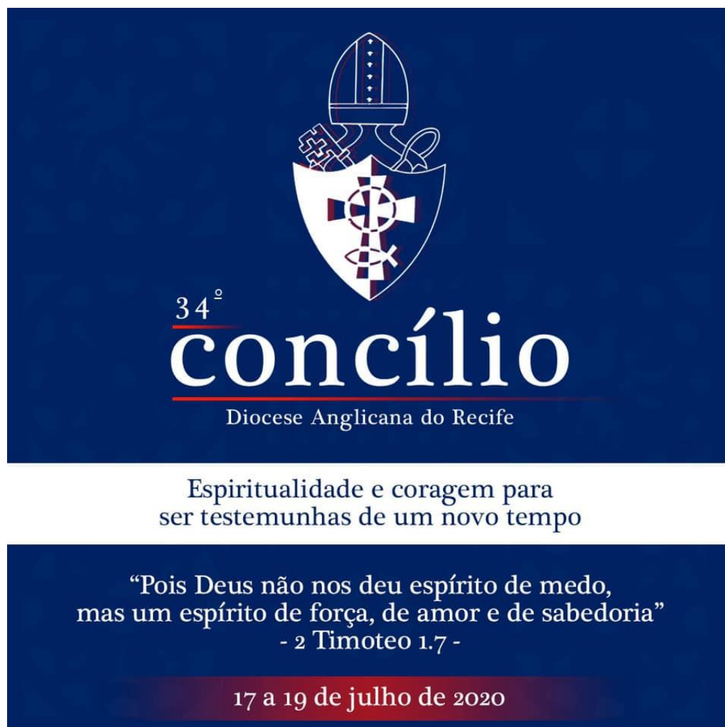
Figure 1: The Council's logo.

The Co-ordination Team was created to organize the entire structure of the council, through the schedule to the virtual rooms of Zoom that would host the activities and the elections to renew the commissions with new members, and to plan the activities of the diocese for the next two years. The motto chosen was 'Spirituality and Courage to Be Witnesses to a New Time', the biblical text extracted from II Timothy 1. 7: 'For God has not given us a spirit of fear, but of power and of love and of a sound mind' (NKJV), and the logo was released on all social networks.