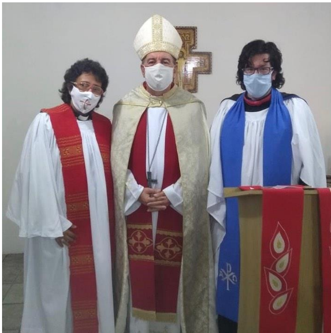
Figure 2: Bishop João Peixoto during the opening Holy Eucharist of the 34th Council, webcast at Jesus of Nazareth parish church, city of Olinda, Pernambuco.

meetings was held. During this period a series of thirteen videos on spirituality was launched for the participants to meditate on.