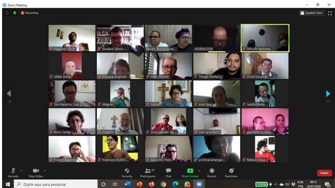
Figure 3: Session of the 34th Council, via Zoom.

On Sunday morning, the opening prayer was led by the North Archdeaconry. At 8.30 a.m., the elections to the diocesan commissions took place, and next the reading and homologation of reports of the work done by each commission during the last year. After lunch there was the presentation of the Strategic Diocesan Plan . The main project is the renovation of the building next to the cathedral and the construction of a hostel to create funds for the diocese. This project is being sponsored by Trinity Church, Wall Street. Also was presented the report of the Anglican Church's Service of Development and Diakonia (SADD) which had the duty of distributing donations of food and supplies to needy families during the pandemic. With the final greetings of the bishop, the council's last session was finished.